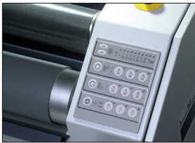
Touch-pad control with predefined settings for temperature, speed and substrate thickness.